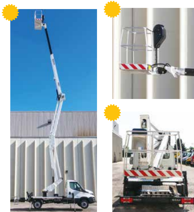
[ KIT: IVECO ]